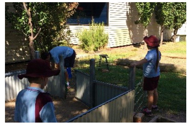
Makayla Good VCAL Student