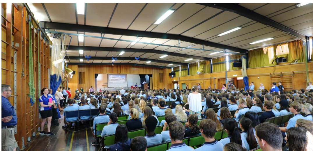
Students gather in Galvin Hall for an assembly

These are items or services that are essential to support the course of instruction in the standard curriculum program that parents and guardians are responsible for, ( i.e. exams, subject revision, online subscriptions, text books and other paper based college learning materials that students take ownership) (DET Policy). The cost for each selected subject is included in the school portal.