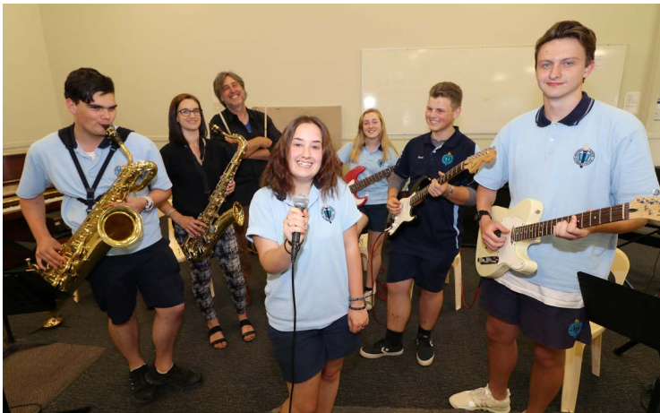
Music students attend their last rehearsal before the launch this weekend.

Students and members of the community are invited to this event at Junction Square this Saturday from 9.30am.